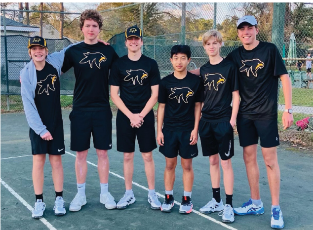
Epiphany varsity men's tennis team