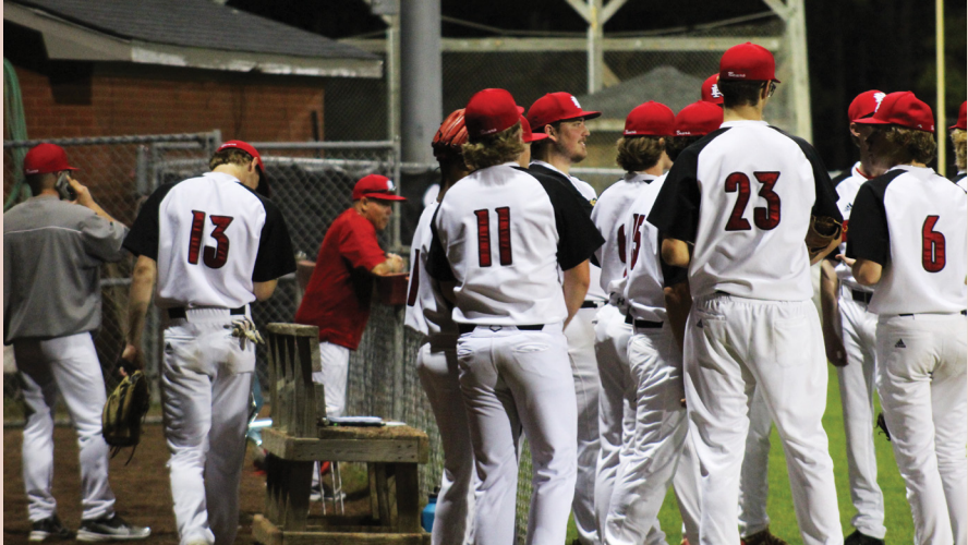
New Bern Bears varsity baseball team