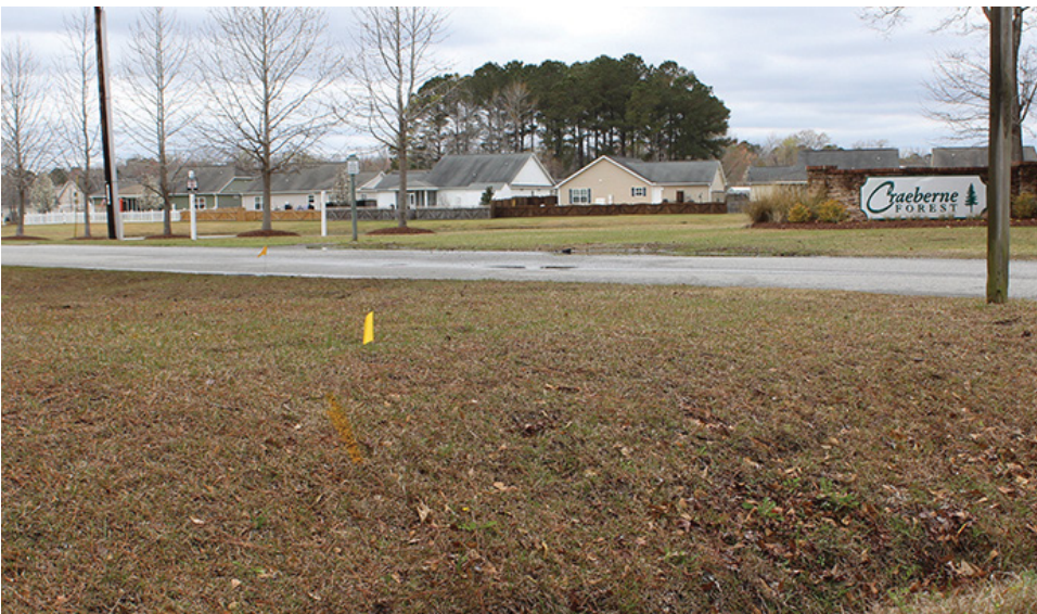
Gas line flags on Trent Creek Road and the entrance to Craeberne Forest subdivision taken on March 13, 2023.