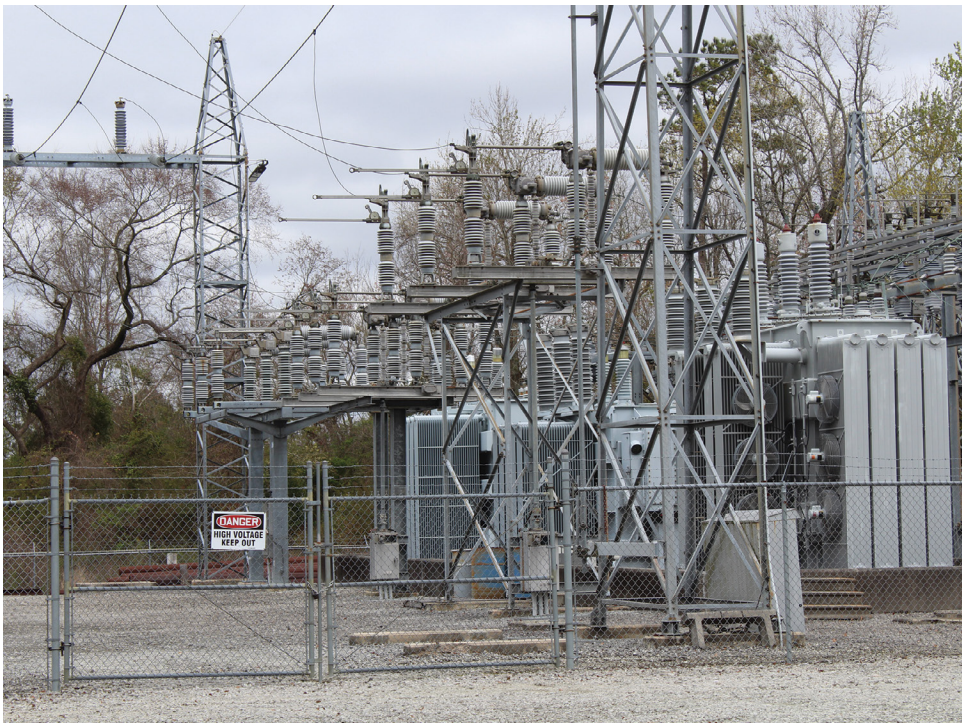
Electric substation in Eastern North Carolina.