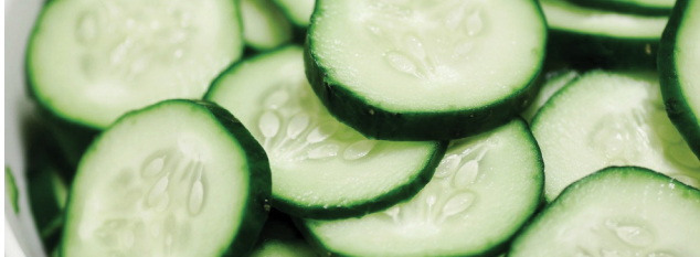
"Cucumbers en route to pickledom"