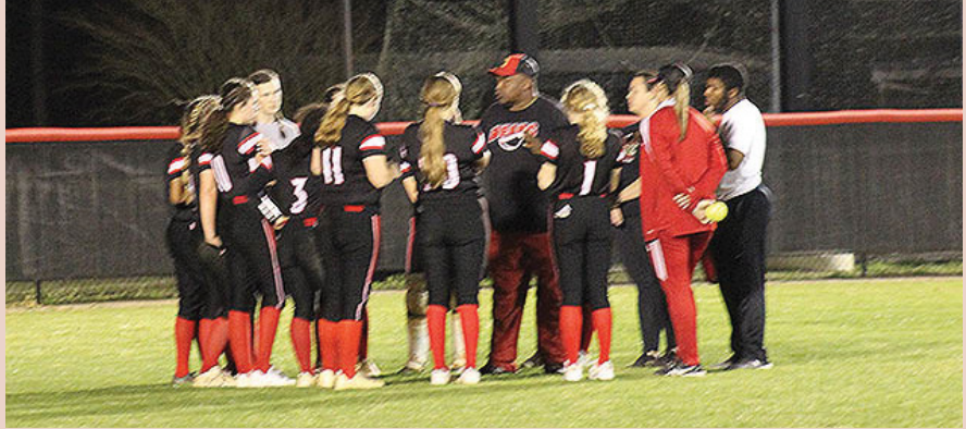
New Bern Lady Bears softball