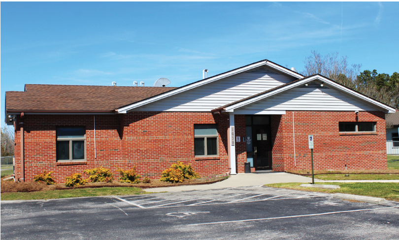
Craven Pamlico Animal Services located on Old Airport Rd.

The CC Health Department responded to NBN's initial public record request on March 7 within an hour and provided the most recent Facility Compliance Inspection report by the Animal Welfare Section of NC Department of Agriculture and Consumer Services dated Feb. 1, 2023. The inspector noted, "I performed an annual