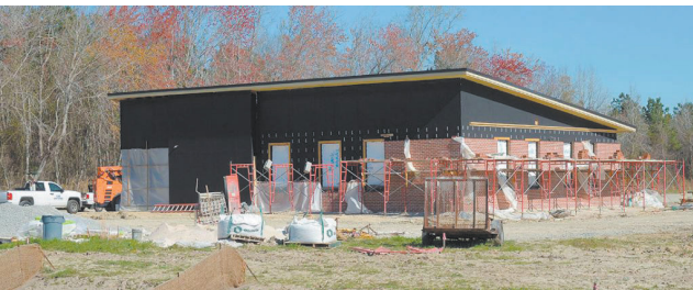
A new facility to house Craven County’s CARTS program is just one of the projects outlined in a facilities master plan that is currently under construction or in the planning stages.

“To keep the court system working and the