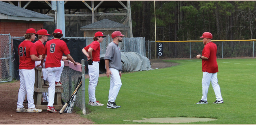
New Bern Bears JV Baseball Team