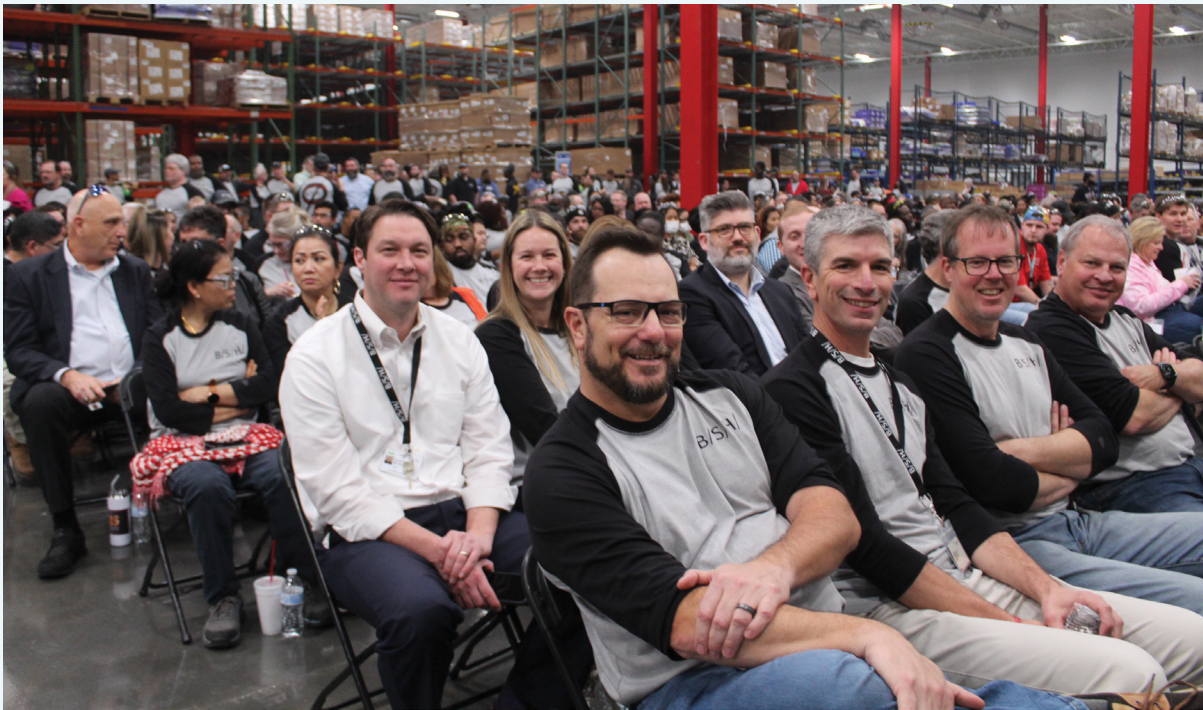
Over 700 people attended BSH Home Appliances 25th anniversary celebration of the New Bern Campus on Feb. 16, 2023. The factory was filled with employees, members of the community, local and state officials and international BSH executives.